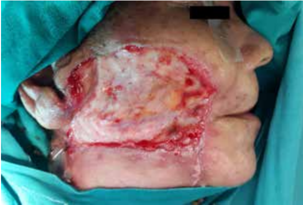
Figure 10. NeoDermis