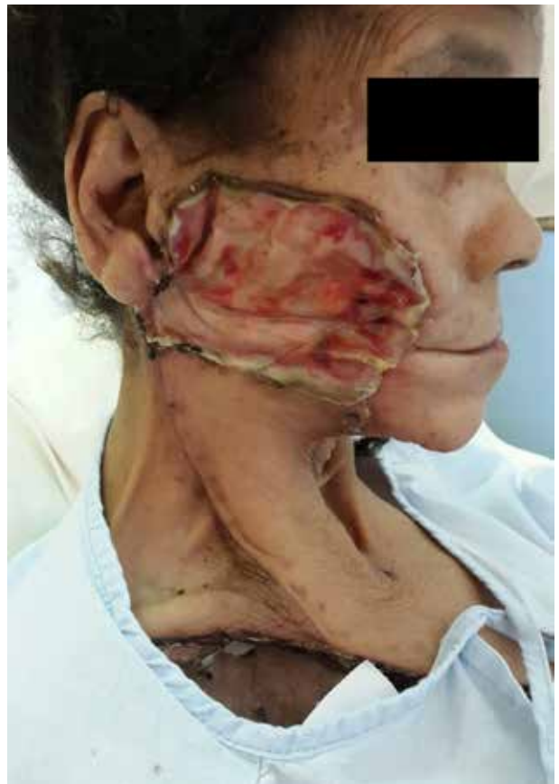
Figure 9. Day 21 Post Op