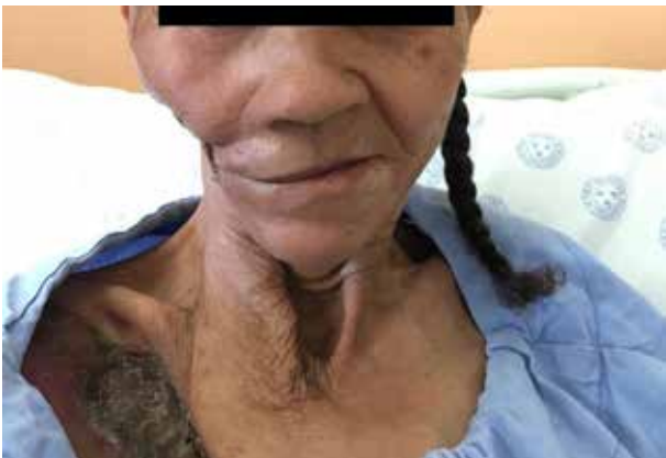
Figure 12. Day 5 Post Op - FTSG