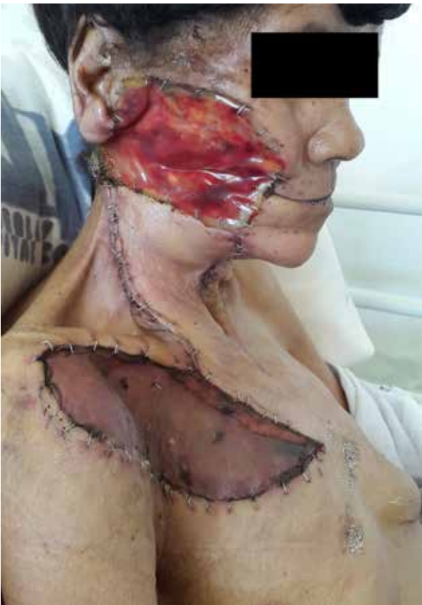
Figure 7. Day 8 Post Op