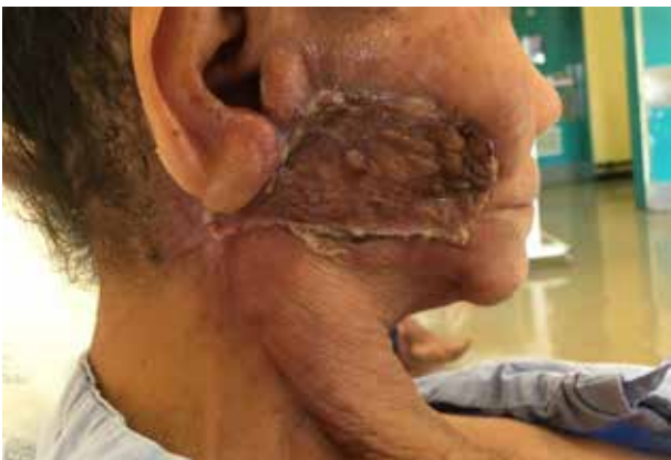
Figure 13. Day 9 Post Op