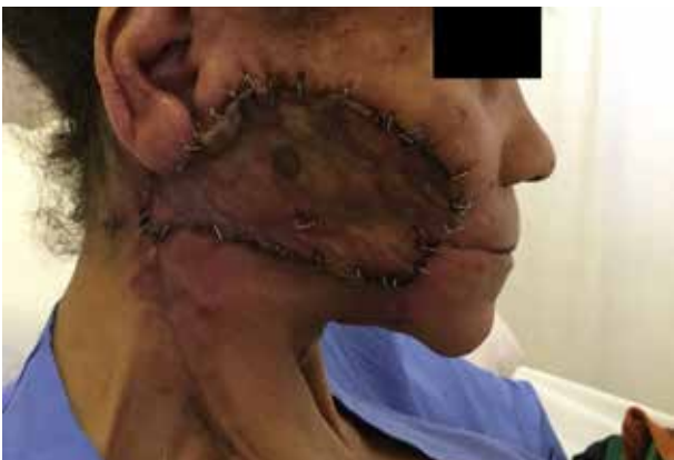
Figure 11. Day 5 Post Op - FTSG